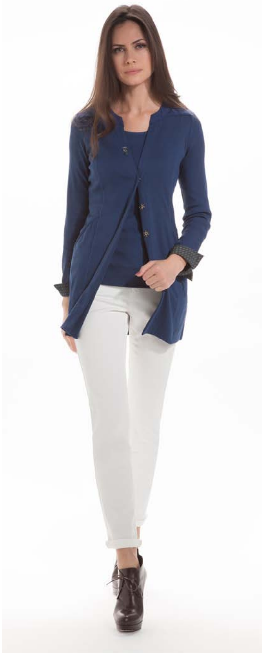
ADIR-CRY 2287H 34934 LUNAW 2287 349 FERIDA 4583 140