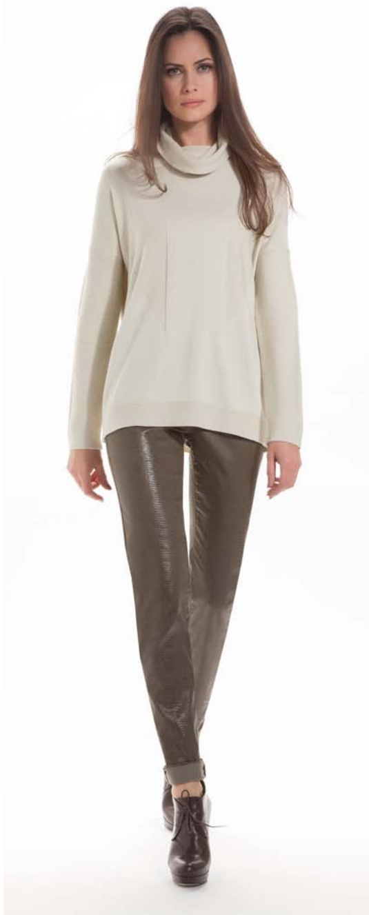
CIVIS 3212 819 FLOW 4585 82982