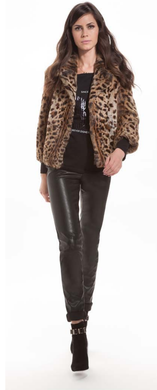
BILEA 8114 25613 LARRY-SIN 2298A 99099 FLOW 8111 990