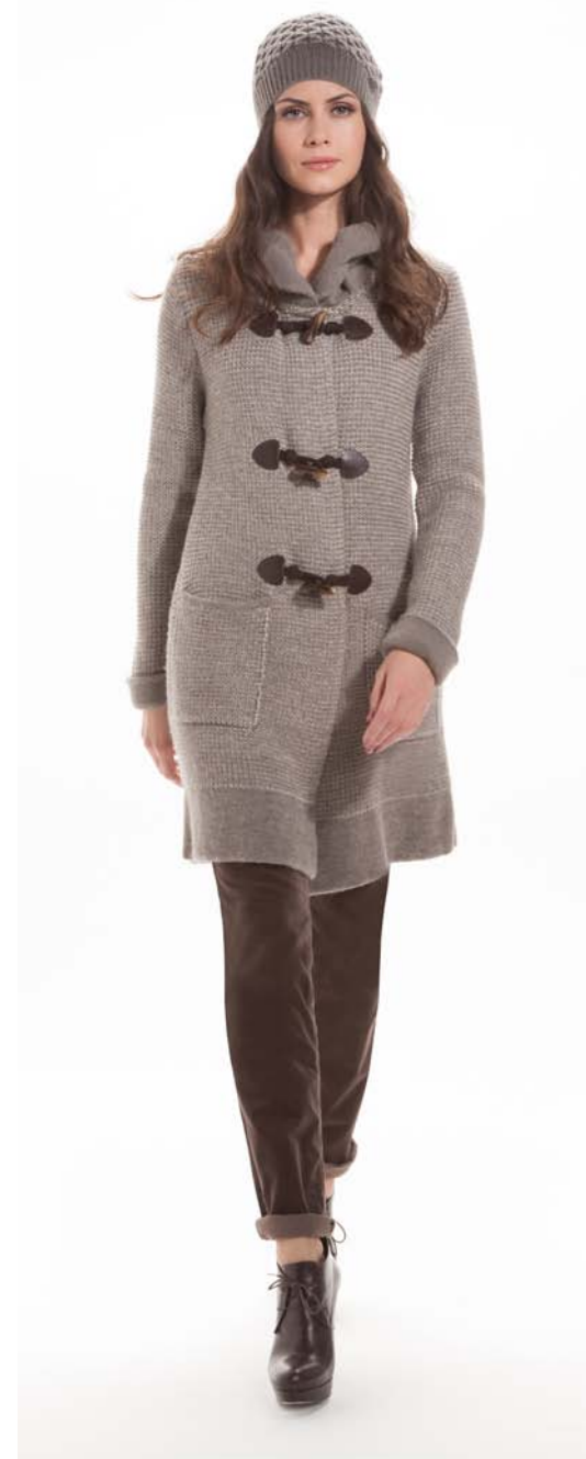
ELIS 3148A 24622 FUGGY-INT 4070 246 ZAMMY 3148 2467