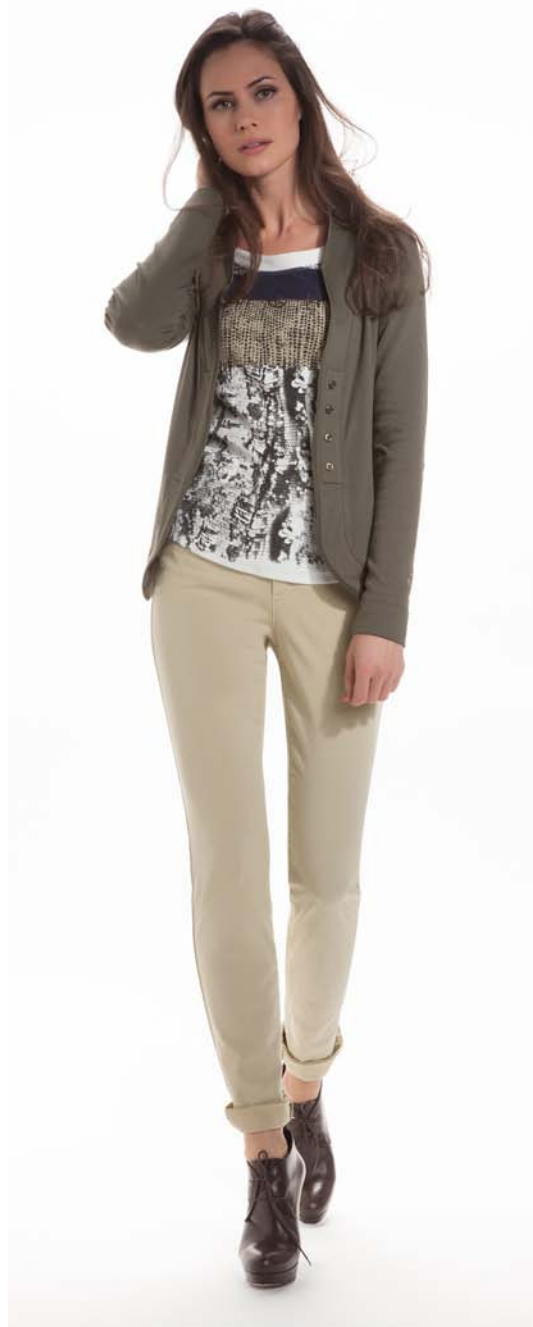
ABNER-GIF 2287 829 MADEU-PAM 22871 14824 FIRE-GIF 4583 819