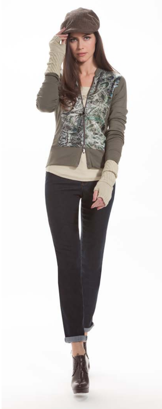
ADEN 2287F 82934 MADEU-GIF 2287 819 FURBY-CRY 4587 539 ZINA 3205 819