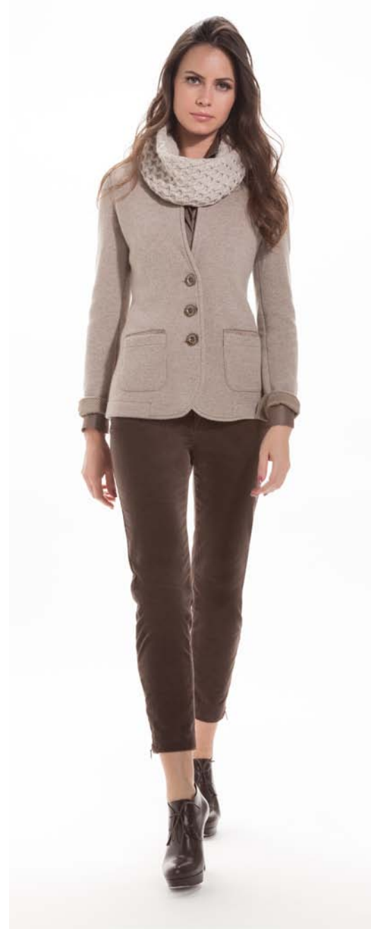
ANITE 5164 24622 SALTY-CRP 5166 246 FISTER 4070 246 ZALEM 3148 2227