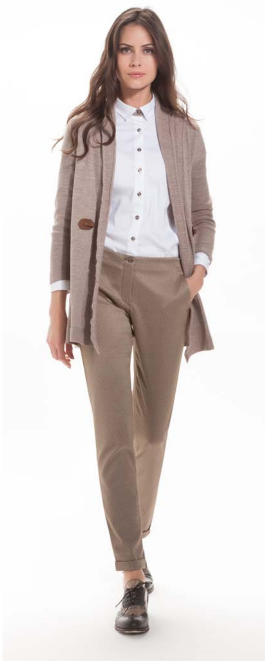
CAST 3212 24624 SEE 4267 100 FAST-ST 7182 24622