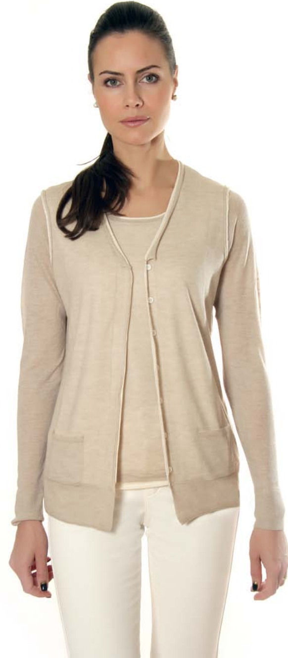
DAN 3227 2037 DENVER 3227 2037