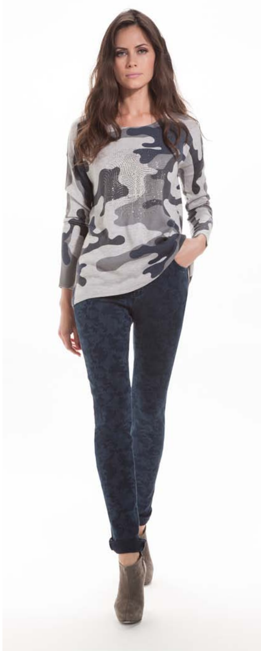
EDMAR 3228A 97335 FLOW 4590 526