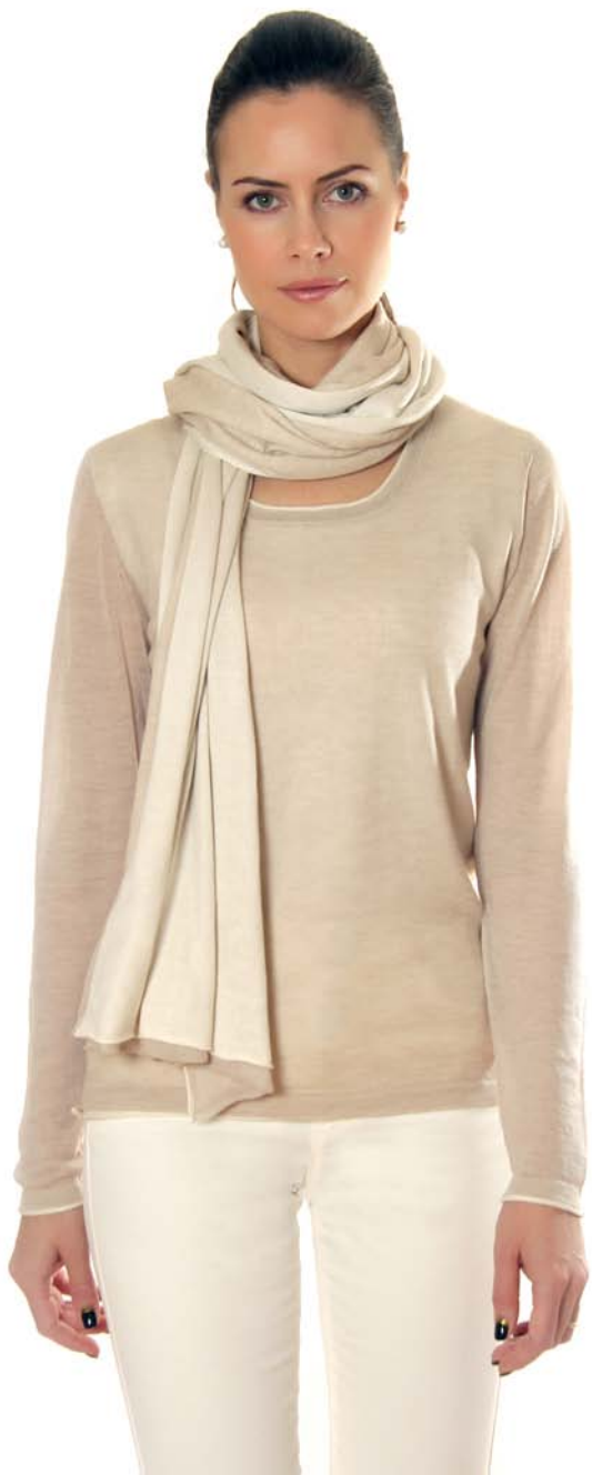
DUBLIN 3227 2037 ZAD 3230 2037