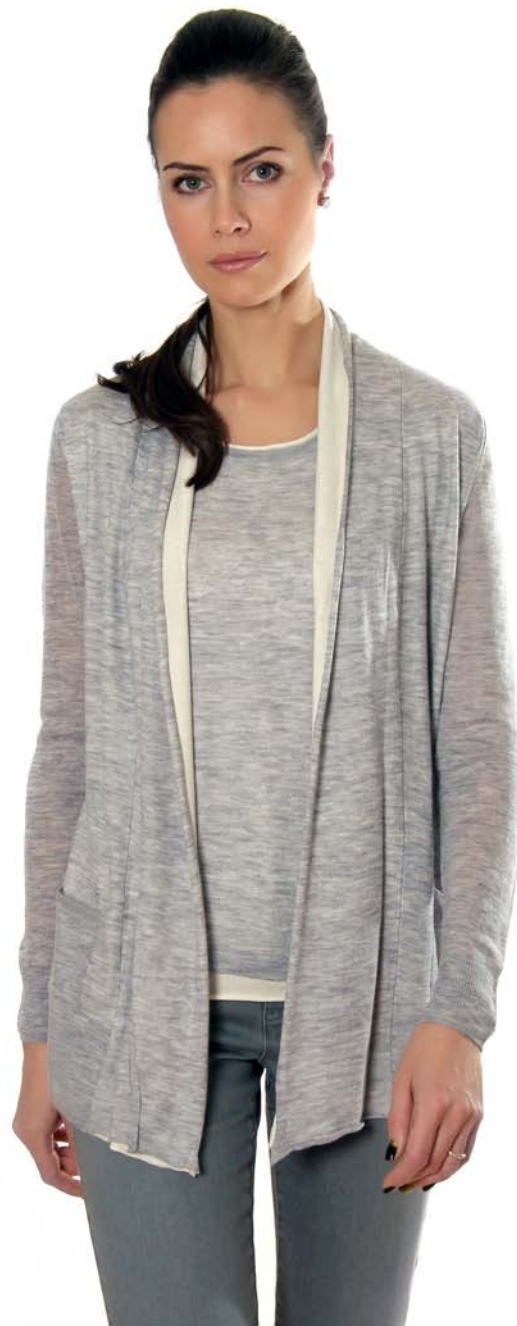
DOTTY 3227 9377 DENVER 3227 9377