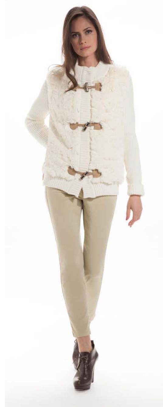
BRUNO 8110H 14014 FIRE-GIF 4583 819