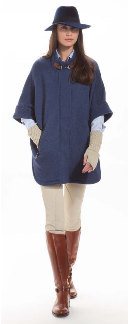
BLENDY 5164 34934 SAKE-CRY 5165 323 FINT 4584 819 ZINA 3205 819