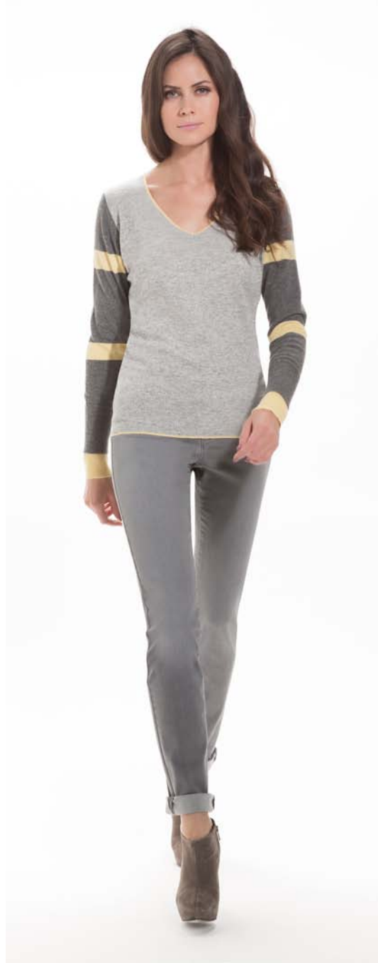
GULY 3209M 97394 FLOW 4595S 59059