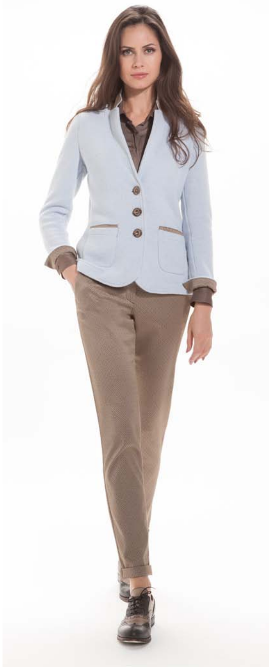
ANITE 5164 30822 SALTY-CRP 5166 246 FAST 7182 24622