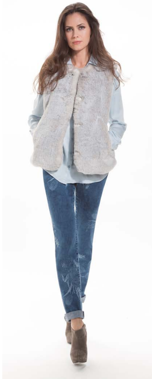
BOVE 8112 9079 SALTY-CRP 5166 FLOW 4589 533