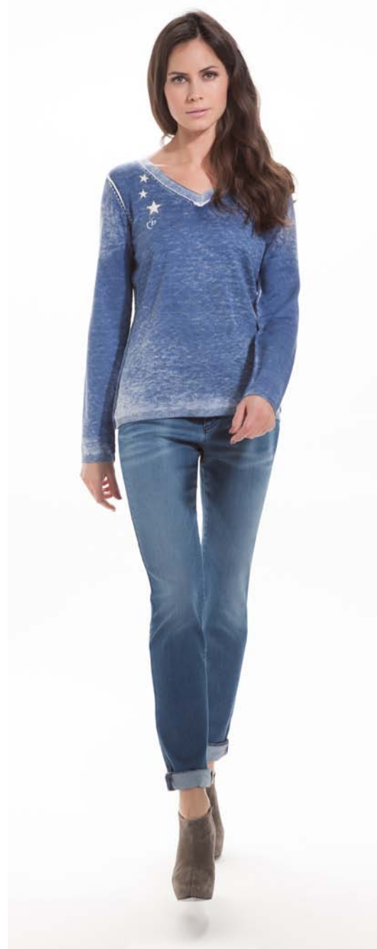
EMIR 3228 54554 FLOW 4594Y 54554