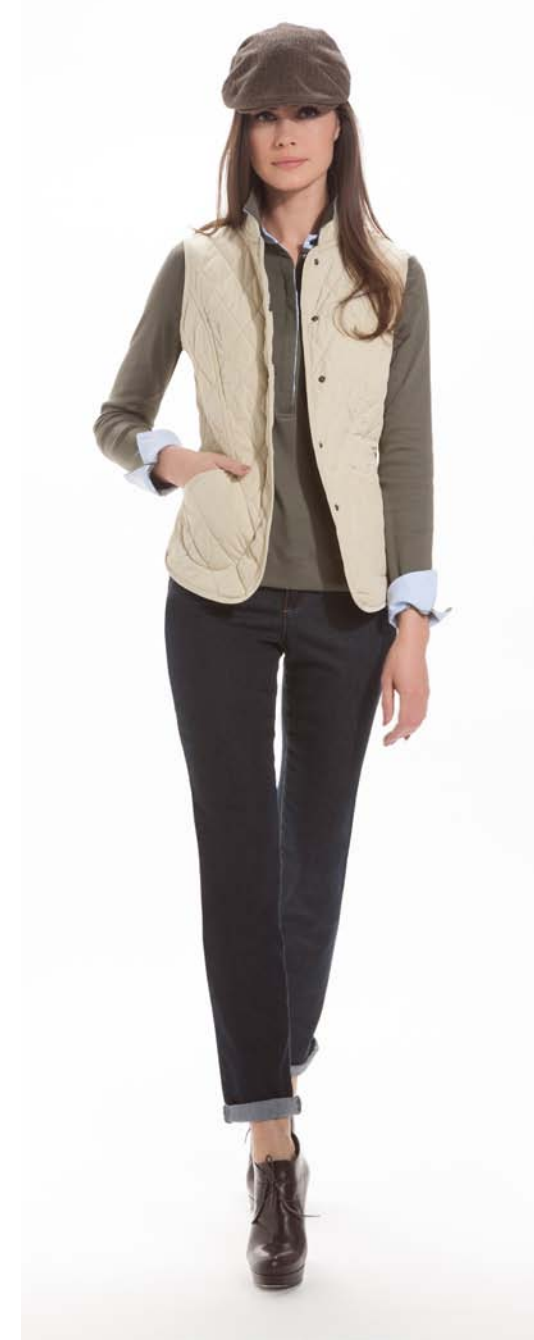
BRAS 8100 8198 MEGOS-GIF 2287 829 FURBY-CRY 4587 539