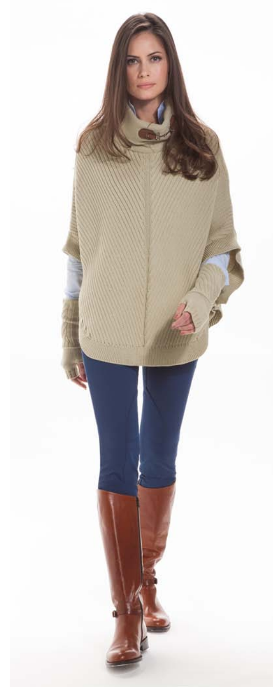
GLEND 3205 819 SAKE-CRY 5165 323 FINT 4584 349 ZINA 3205 819