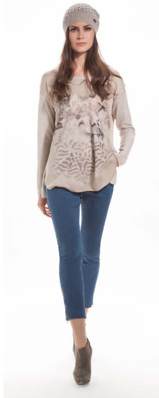
CAT-FIM 3212V 22222 FISTER 4594 545 ZAMMY 3148 2227