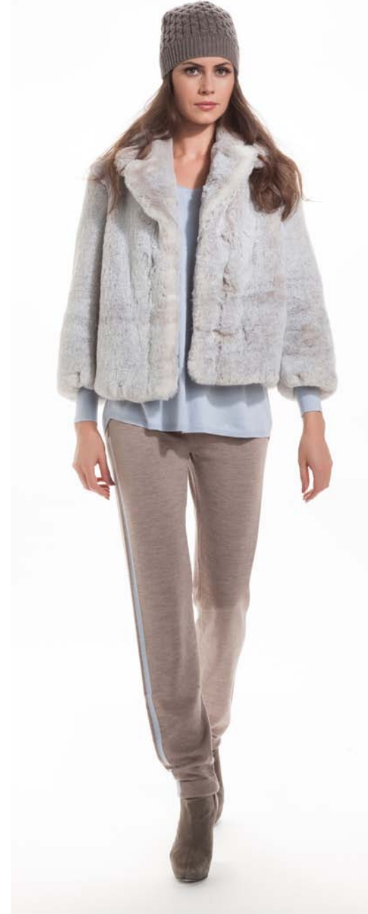
BILEA 8112 9079 CELTIC 3212 308 FESAR-CP 3212G 24630 ZAMMY 3148 COL.2467