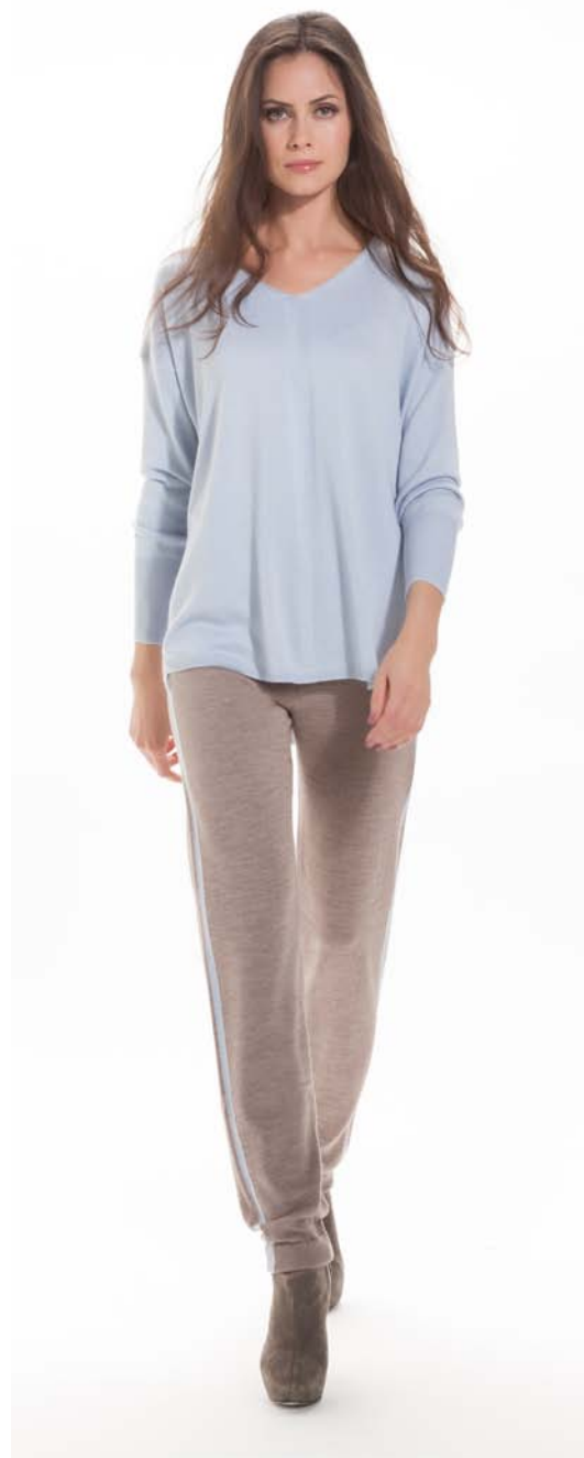
CELTIC 3212 308 FESAR-CP 3212G 24630