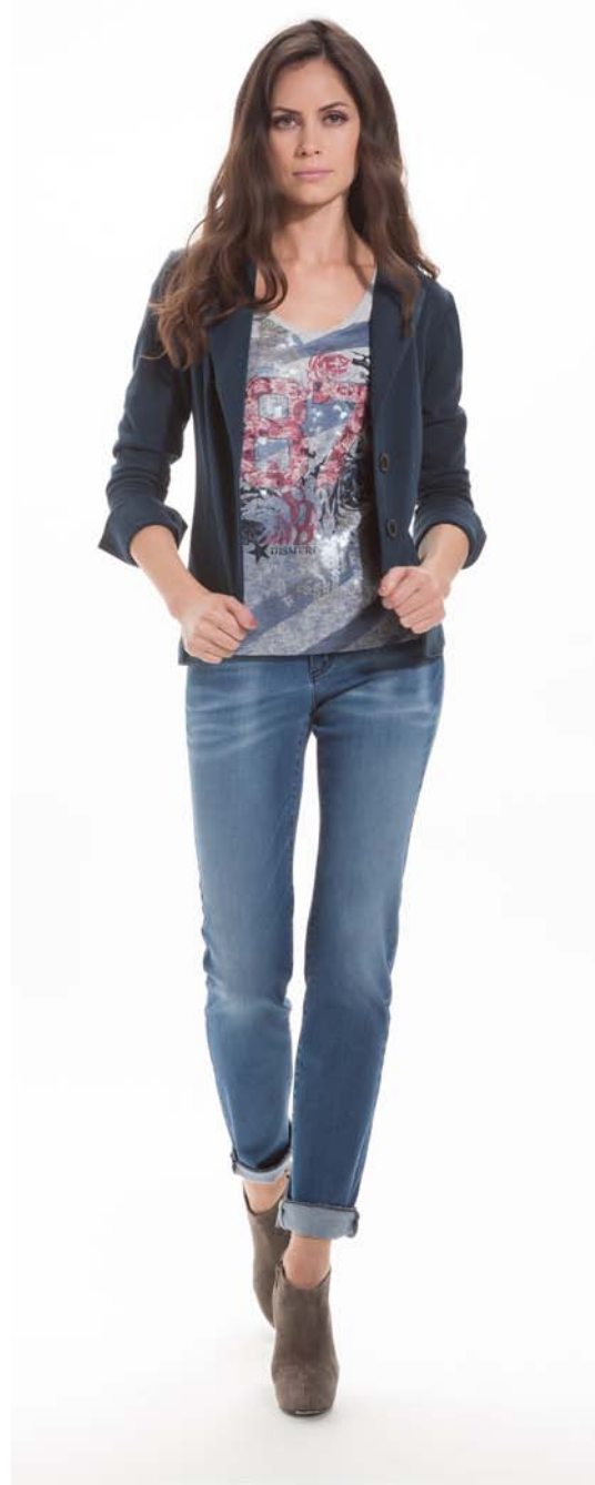
NATTY-SIN 2235 354 LYN-87 91071 FLOW 4594Y 54554