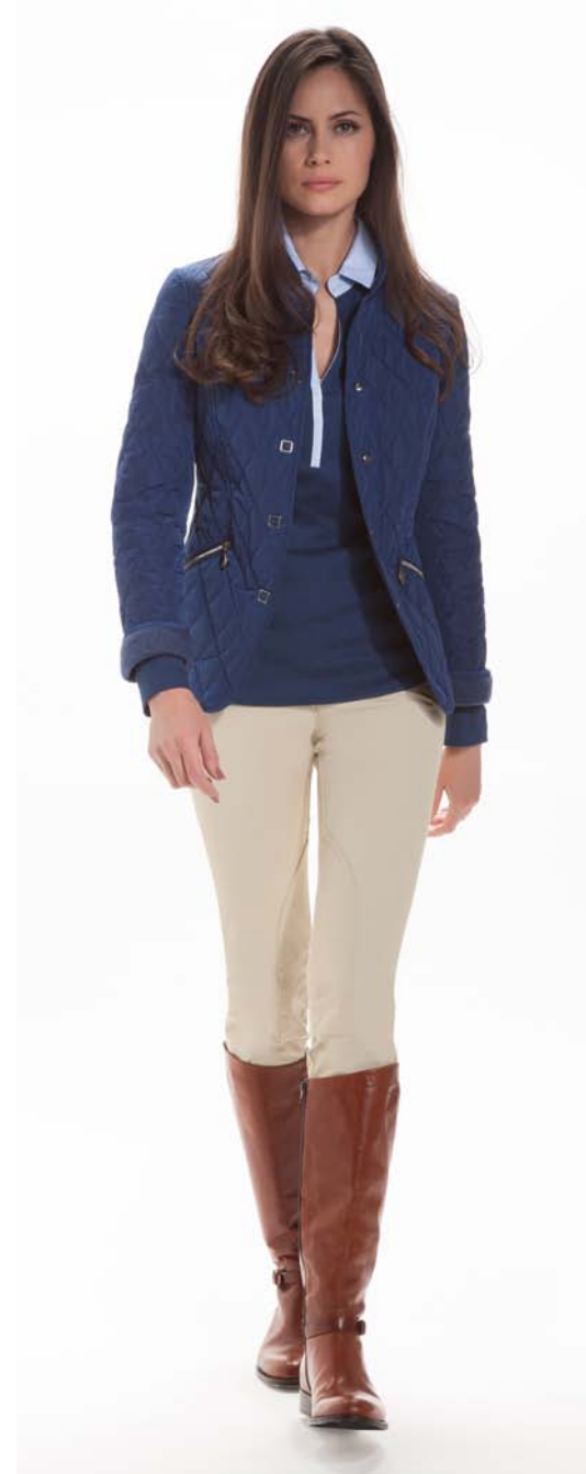
BRANCA 8100 3498 MAREN-GIF 2287H 34934 FINT 4584 819