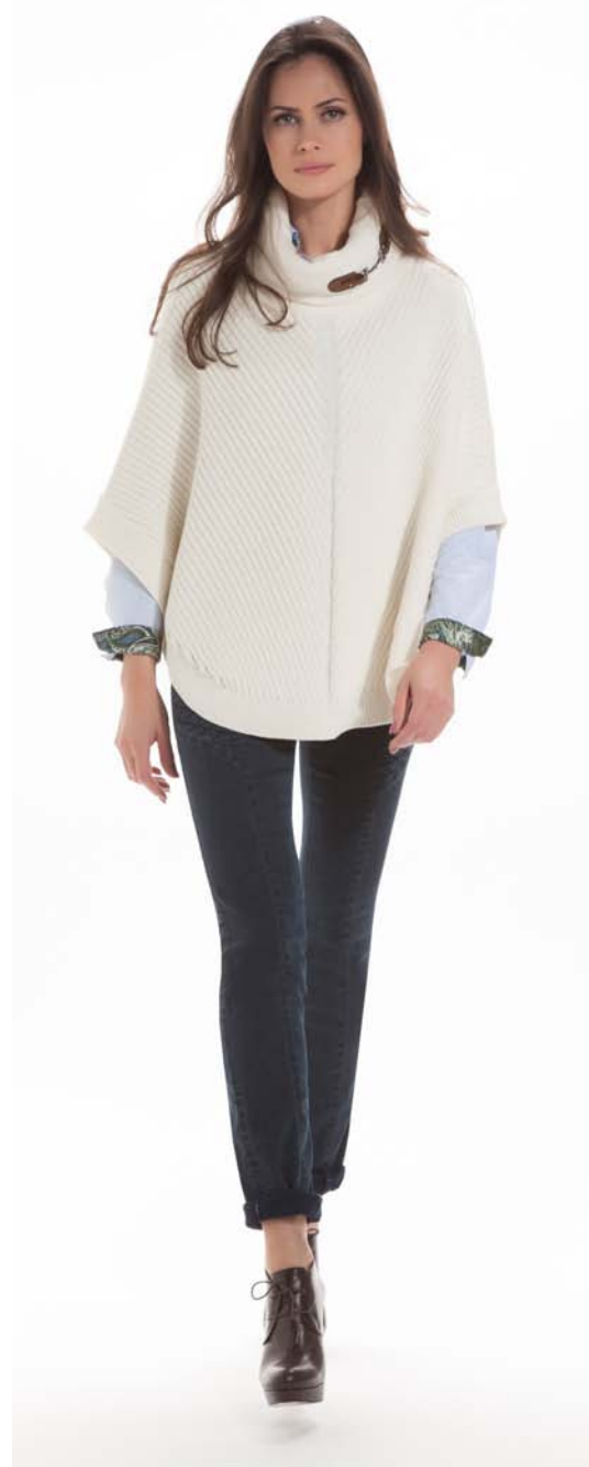
GLEND 3205 140 SAKE-CRY 5165 323 FURBY-CRY 4587 539