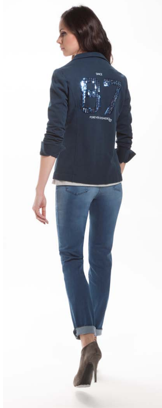
NATTY-SIN 2235 354 LYN-87 91071 FLOW 4594Y 54554