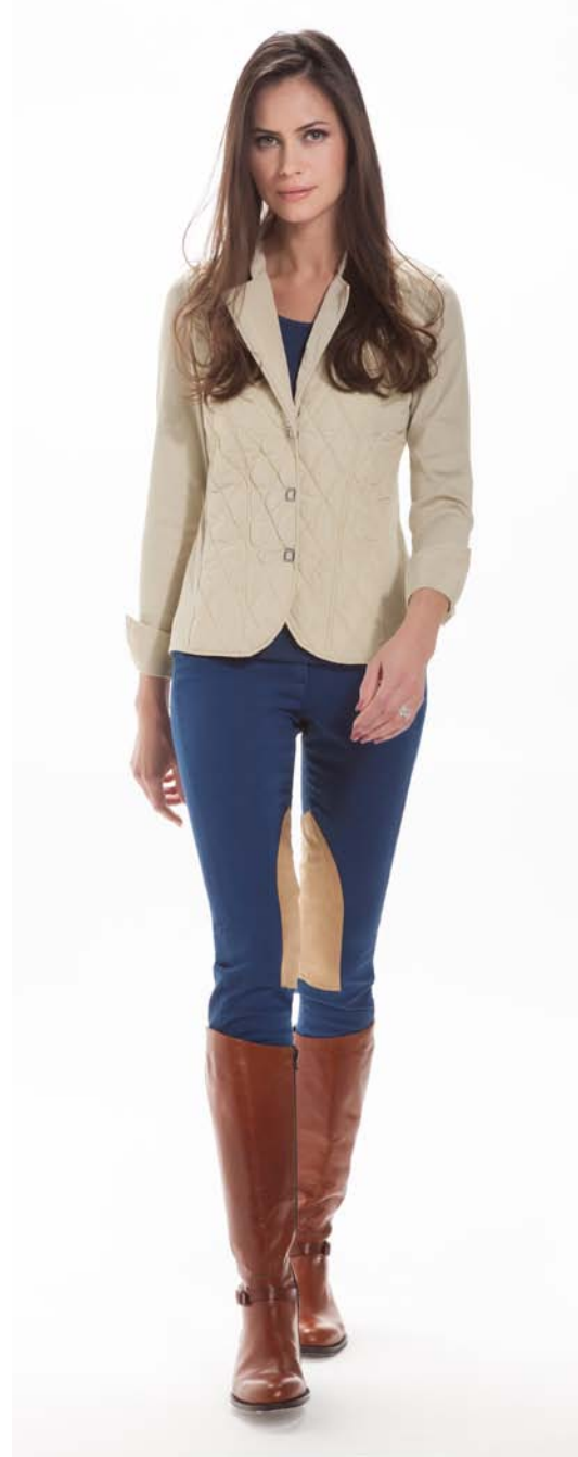
ALAIDE 2287N 81981 LUNAW 2287 349 FILIPPO 4583 349