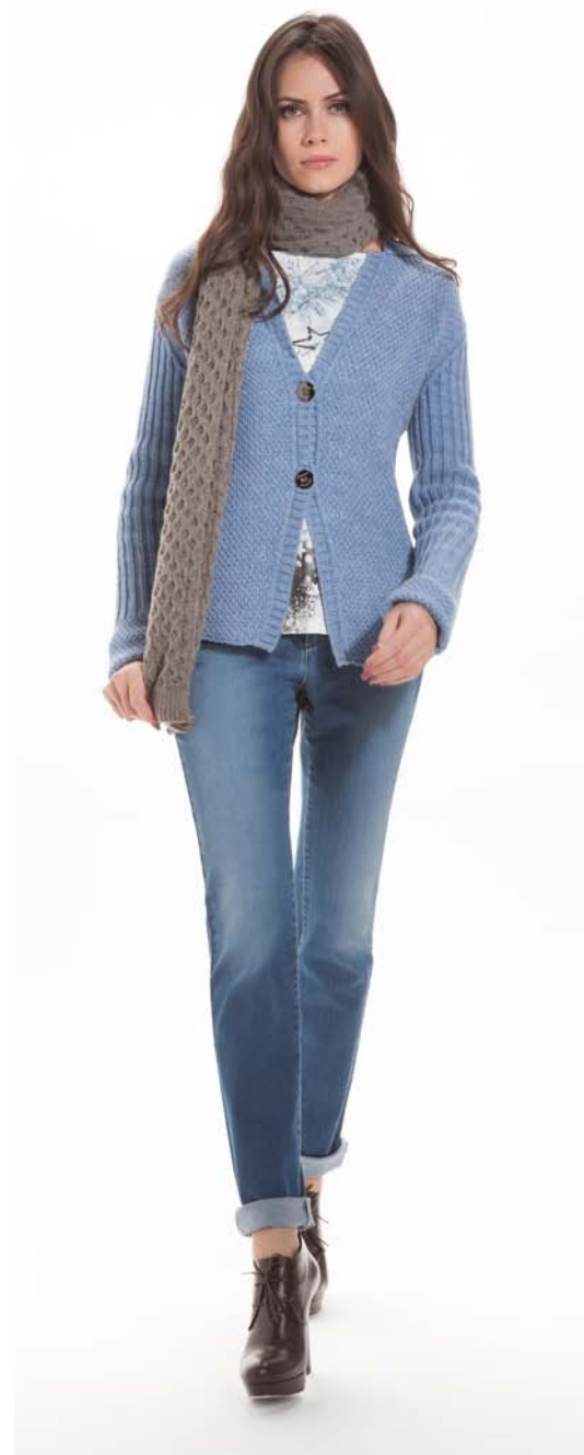
EMBER 3148 54554 MAREL-STE 5166A 30813 FUGGY-INT 4594S 54554 ZOX 3148 2467