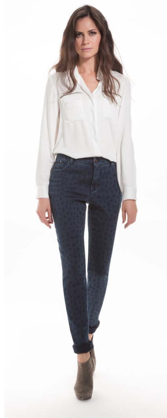
SANDY-SS 5166 130 FLOW 4596 526