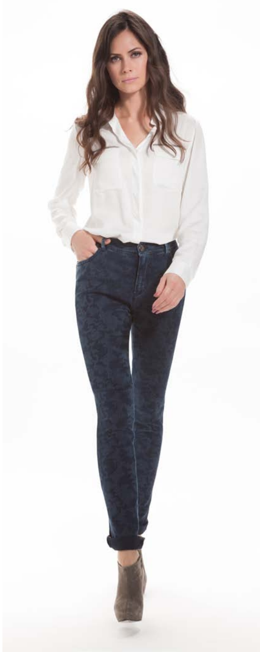
SANDY-SS 5166 130 FLOW 4590 526