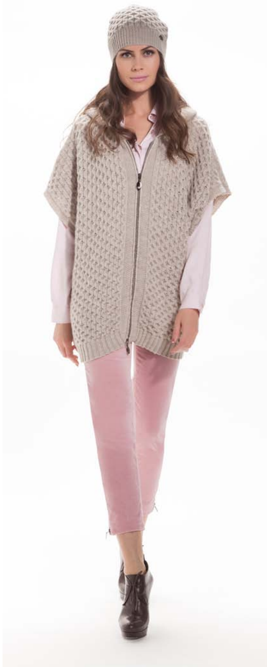
EMY 3148 2227 SALTY-CRP 5166 633 FISTER 4070 633 ZAMMY 3148 2227