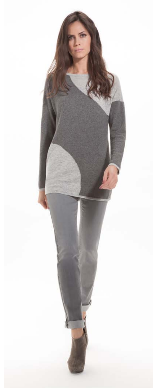
GUSTAV 3209L 97390 FLOW 4595S 59059