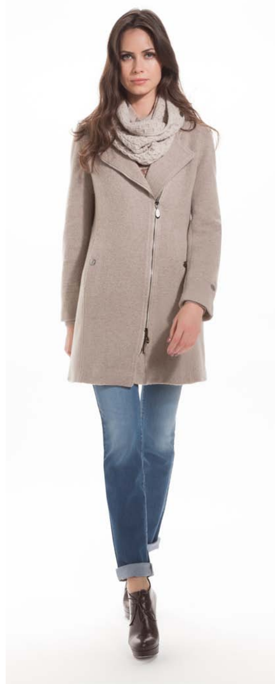
BINNY 5164 COL.24622 FUGGY-INT 4594S 54554 ZALEM 3148 2227