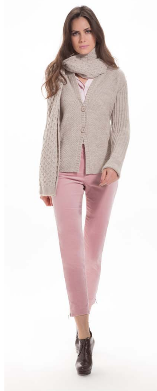
EMBER 3148 2227 SALTY-CRP 5166 633 FISTER 4070 633 ZOX 3148 2227