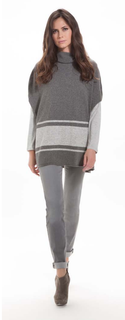
GLAM 3209L 97390 LYN-PIZ 2276B 91091 FLOW 4595S 59059