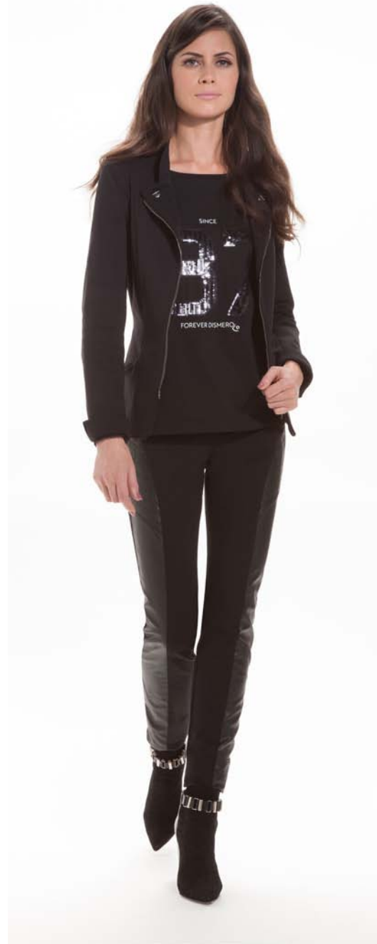
ALY 2296 990 LARRY-SIN 2298A 99099 FLENG 2297A 99099