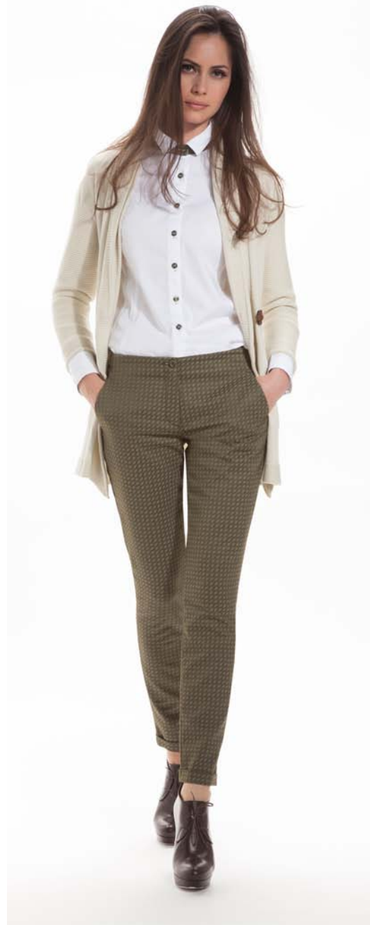
CAST 3212 819 SEE 4267C 10829 FAST 7180 82981