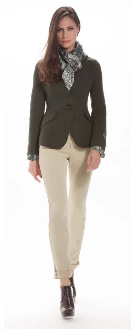
AMIKA-GIF 5164 82996 SALTY 6175 34982 FIRE-GIF 4583 819 VENERE 6175 34982