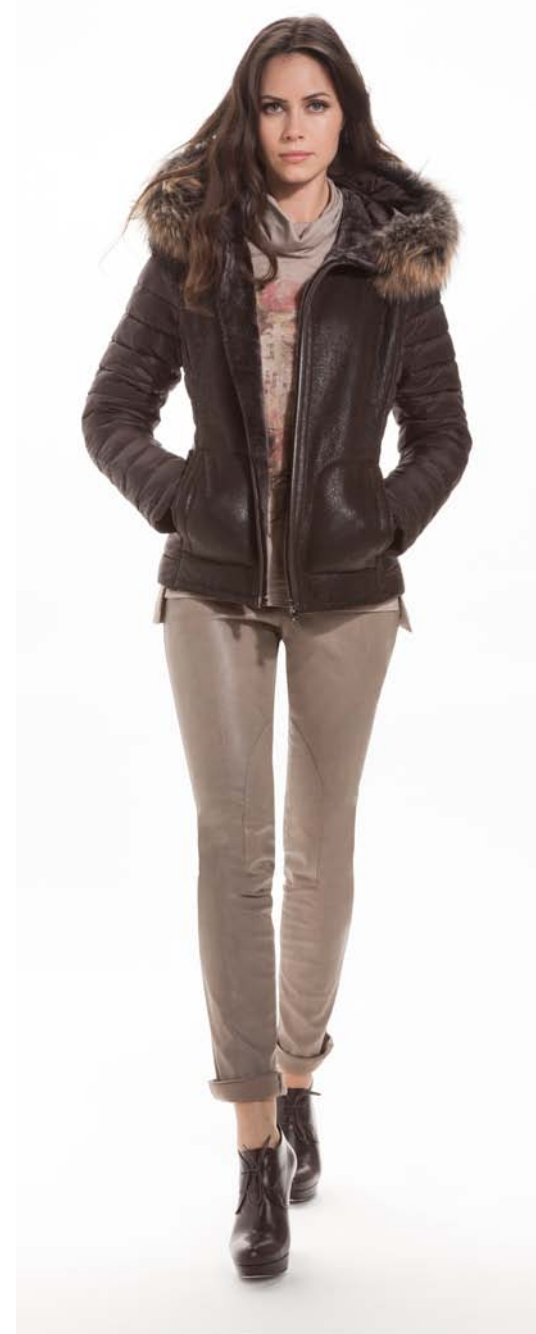
BULL 8113 24622 MUSIC-GRA 2294A 24624 FINT 8111 2138