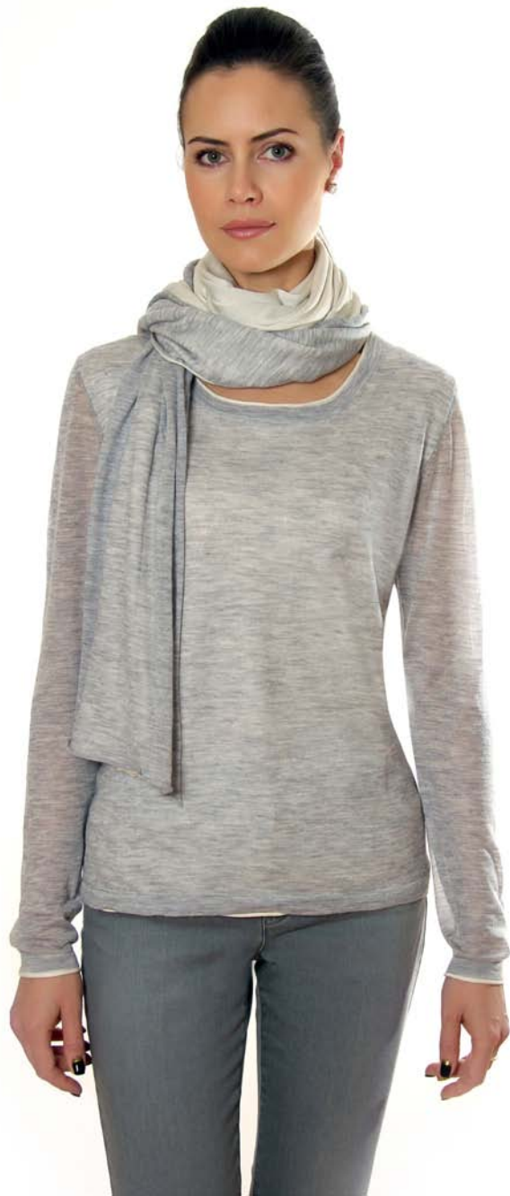
DUBLIN 3227 9377 ZAD 3230 9377