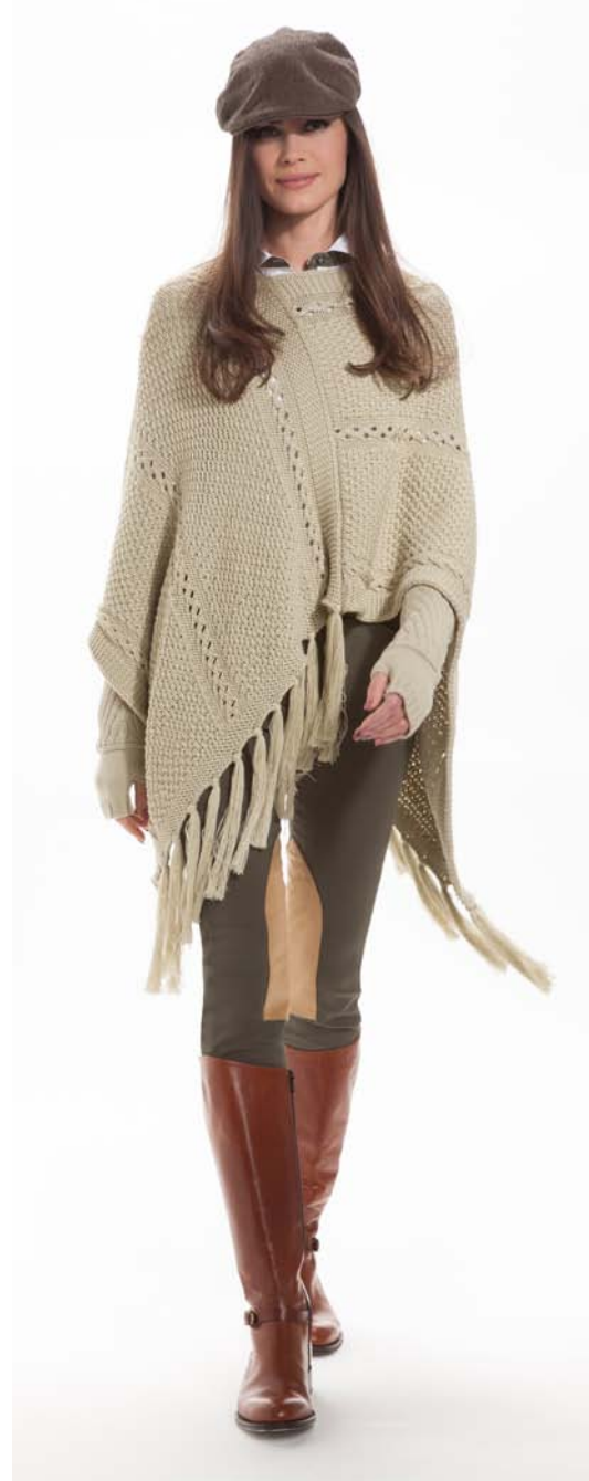
GELLY 3205 819 SEE 4267C 10829 FILIPPO 4583 829 ZINA 3205 819