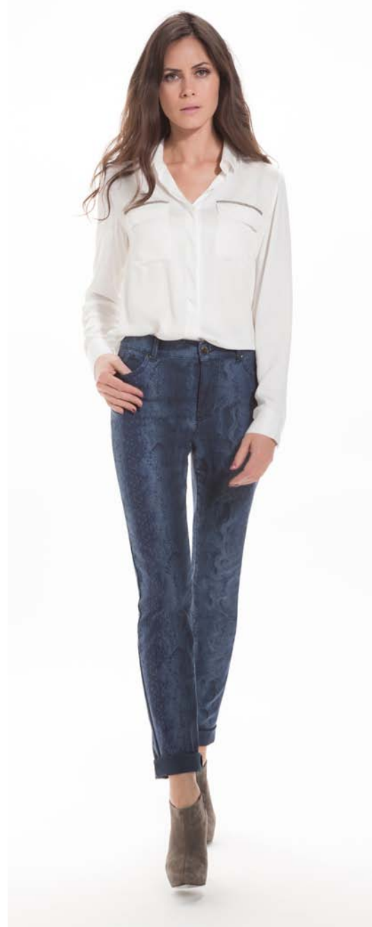
SANDY-SS 5166 130 FLOW 4593 55055