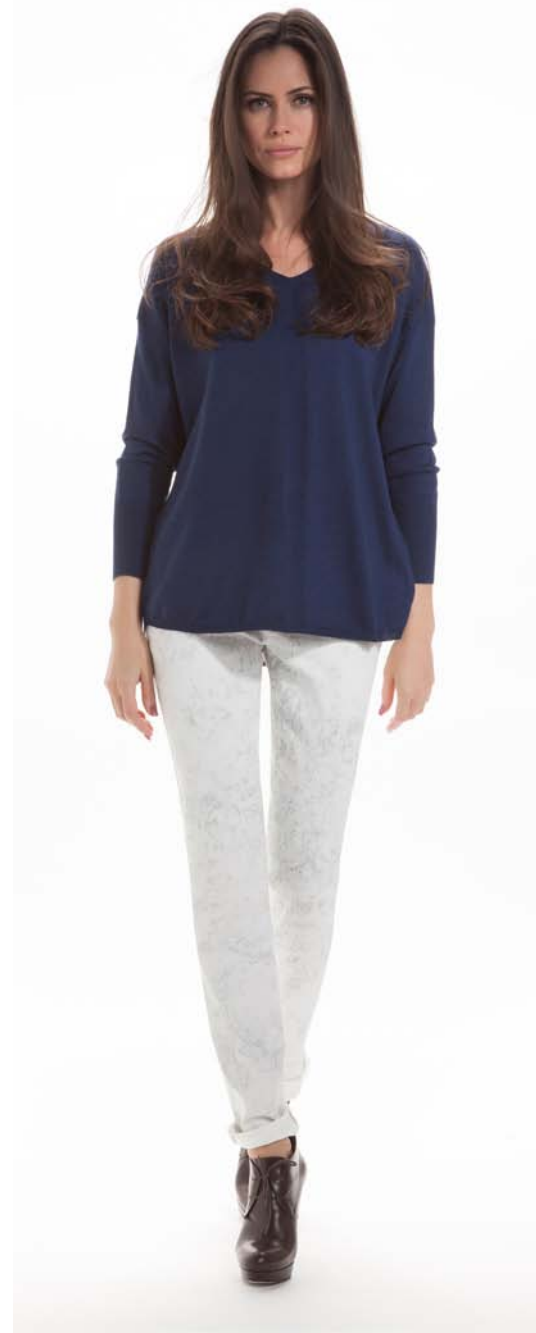
CELTIC 3212 349 FLOW 4588 13034