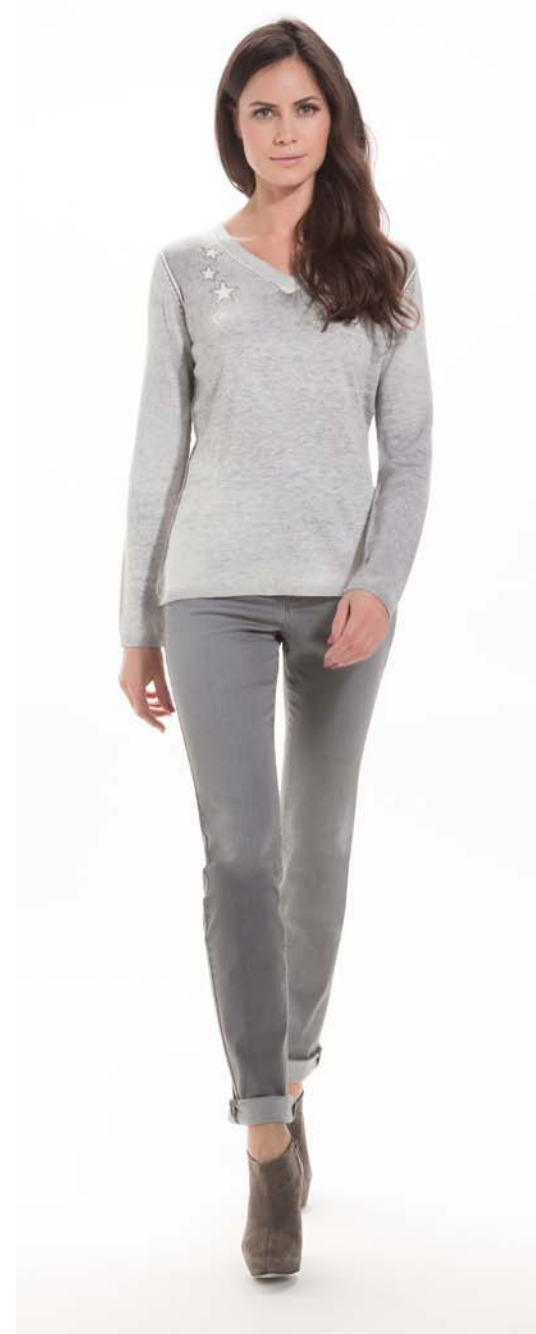
EMIR 3228 91291 FLOW 4595S 59059