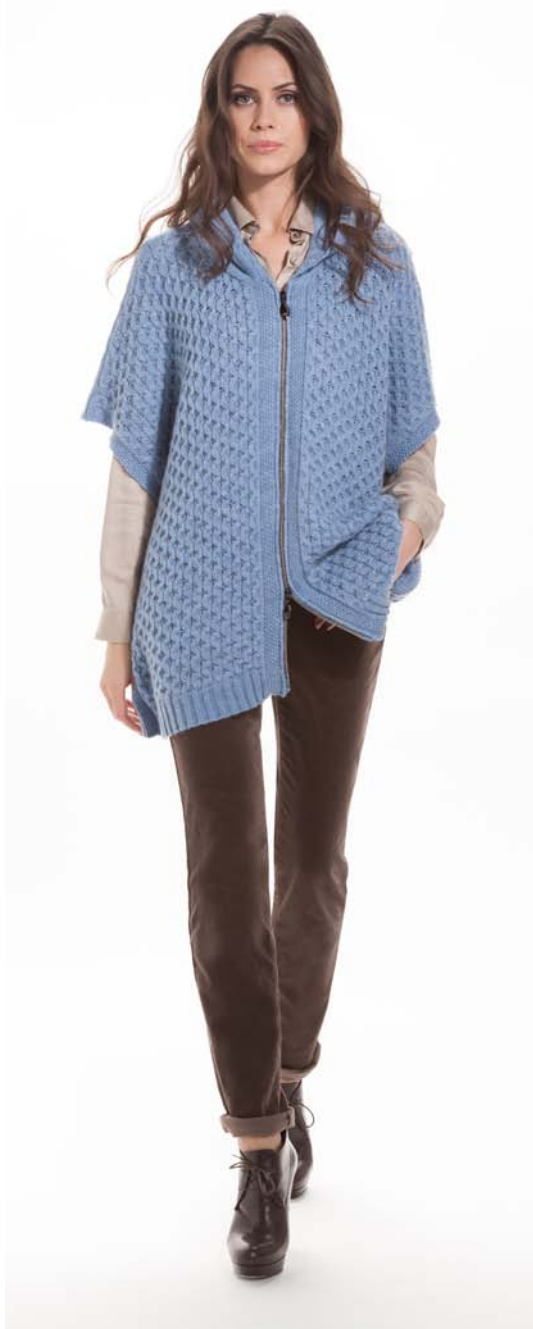
EMY 3148 54554 SALTY-CRP 5166 222 FUGGY-INT 4070 246