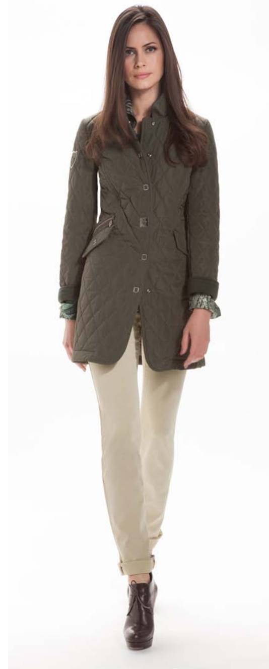
BORIS 8100 8298 SALTY 6175 34982 FIRE-GIF 4583 819