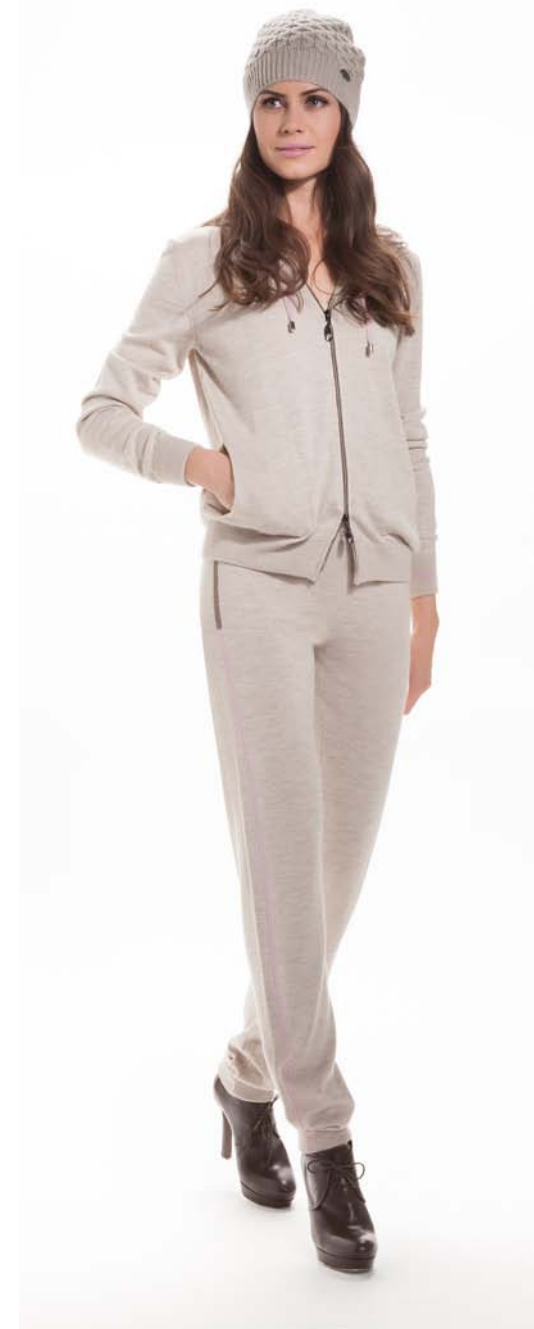
CARMEN-CR 3212G 22263 FESAR-CP 3212G 22263 ZAMMY 3148 2227