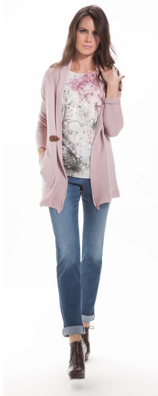
CAST 3212 633 MARE-STE 5166A FUGGY-INT 4594S 54554