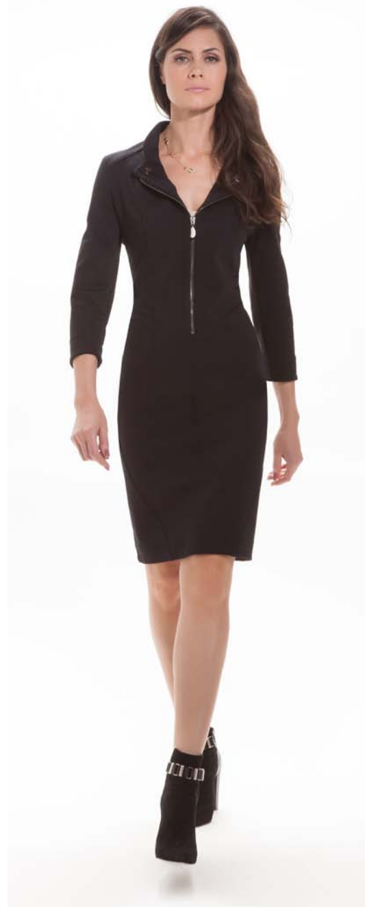
RAM 2296 990