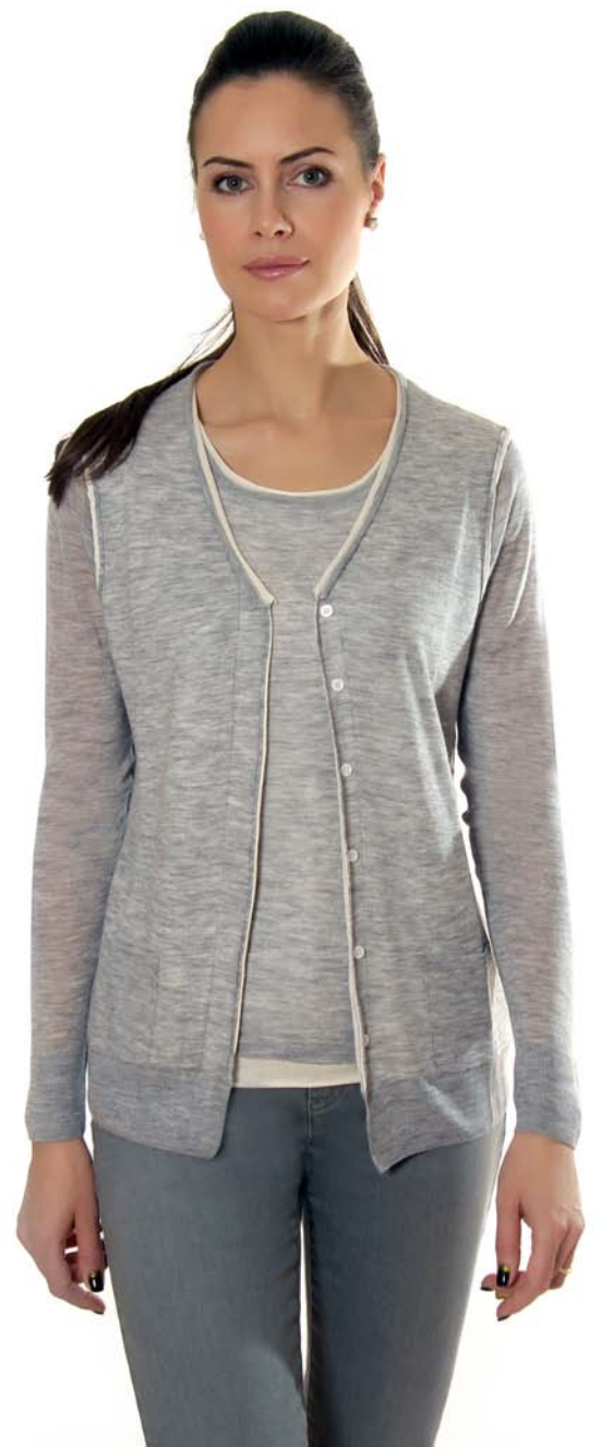
DAN 3227 9377 DENVER 3227